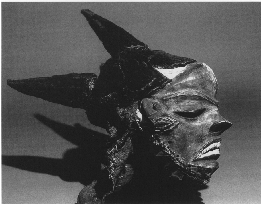
Z. S. STROTHER

However, if the chief's mask is contrasted with that of Pumbu , the killer, one can easily perceive the degree to which Gabama modulated its form. Its surface is burnished and smooth, whereas the Pumbu mask shows the faceting of the adze. The chief's brow is broader and shallower in relief. The eyes are smaller in size and the eyelids "drop"; they do not protrude out to the side as they do in the Pumbu facepiece. In profile, the horns of the coiffure are blunter (Fig. 1), and the nose and chin are rounded. The sculptor Zangela Matangua particularly admired