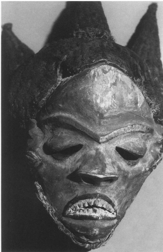
10a, b. Facepiece for Pumbu , the executioner. Wood, raffia fiber; 43.2cm (17"). Acquired in 1913. MRCEB 15424, ©Africa-Museum, Tervuren, Belgium.

In this artist's hands, the protruding forehead, gaping eyes, and razored points of the coiffure, nose, and brow express the character Pumbu's capacity for extremes of psychic and physical violence.