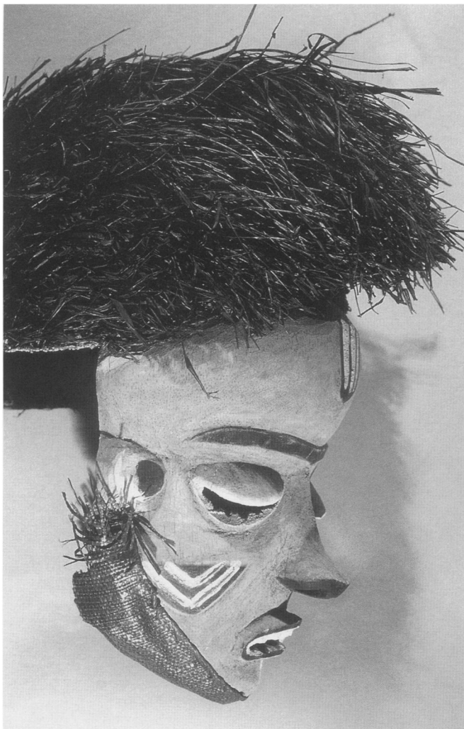
Z. S. STROTHER