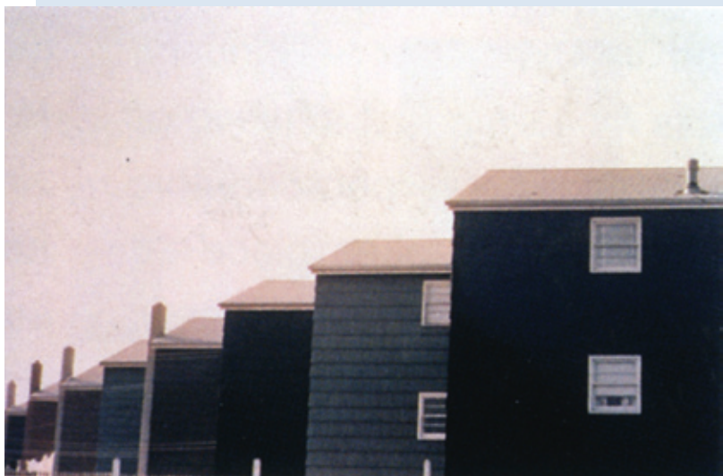
Dan Graham, Homes for America, 1966.