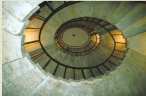
Andrea Palladio, Convento della Carità, Venice, from 1560