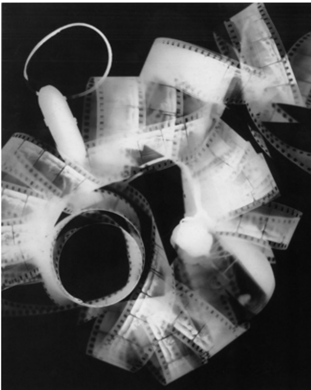
Man Ray, untitled rayograph with filmstrips from Retour à la raison (1923), MoMA