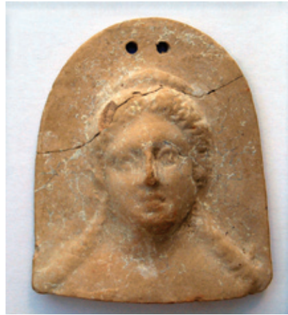
Female Hellenistic terracotta protome from Ithaca

Ägyptens und Griechenlands (2006). His Divine Images and Human Imaginations in Greece and Rome is about to be published by Brill. Currently, his research focuses on the iconography of terracotta figurines from Ithaca (Greece), the pictorial graffiti in the Roman theater of Aphrodisias (Turkey), the significance of Greek temples as political instruments, and the visual constructions of the divine in ancient Greece.