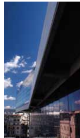
Views of the New Acropolis Museum in Athens, courtesy of the Museum.