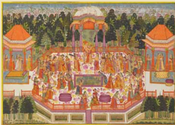
Nagaur, Celebration of Holi , ca. 1729–32, Mehrangarh Museum Trust, RJS 2033.

I am currently working on two Tibetan exhibitions for spring 2010 that address the problematic of sacred space within museums. I've also begun a second major international loan exhibition and catalog with a team of South Asianists from the fields of anthropology, religion, sociology, and history entitled Yoga: The Art of Transformation . It will open at the Sackler Gallery in October 2013.