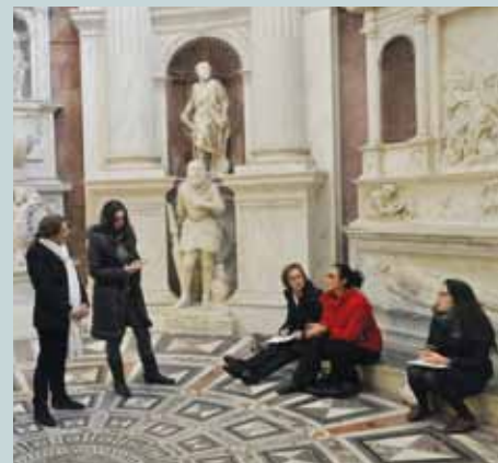
Group in Sant'Andrea al Quirinale, Rome, and S. Giovanni a Carbonara, Naples.