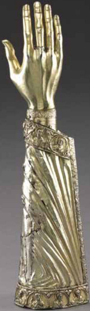
Arm Reliquary of the Apostles, ca. 1190, silver gilt and enamel on oak, 20" x 5.5" x 3.5", German (Lower Saxony), courtesy of The Cleveland Museum of Art, gift of the John Huntington Art and Polytechnic Trust.

In a hitherto unprecedented collaboration with the organizing museums, Columbia's Media Center for Art History produced a publicly accessible, interactive website that allows scholars, students, and the general public to explore key themes and objects in the exhibition and serve as an online teaching tool for classes on the subject. The website is accessible under www.learn.columbia.edu/treasuresofheaven .