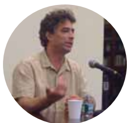
Michael Hardt speaks at the Architecture/Art History PhD Forum.

A new collaboration between the PhD programs of the Department of Art History and the Graduate School of Architecture, Planning, and Preservation at Columbia, the Architecture/Art History PhD Forum provided an opportunity for students to discuss the work of prominent academics and theorists from an interdisciplinary perspective in a focused, seminar-style discussion. Invited speakers, Étienne Balibar,