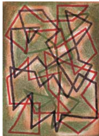
Left: Ary Stillman, Arabesque No. 4 , 1950, color lithograph printed from four stones, uneditioned experimental proof, paper: 23.5" x 18.5", image: 20" x 15", courtesy of the Stillman-Lack Foundation.

More information about Ary Stillman's work and career can be found at www.stillmanlack.org .