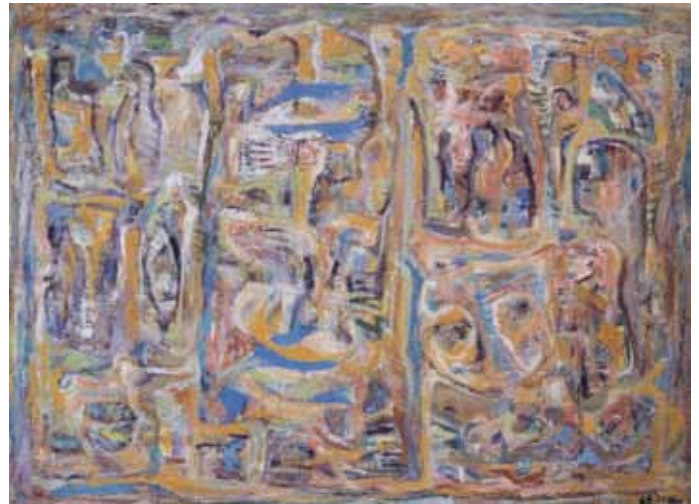
Top: Ary Stillman, Fantasy in Blue and Gold , ca. 1950s and 1964, oil and acrylic on canvas, 27" x 36", courtesy of the Stillman-Lack Foundation.