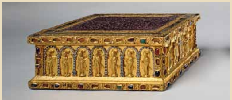
Below: Portable Altar of Countess Gertrude, ca. 1045, gold over oak, enamel, red porphyry, gems, pearls, niello, 4.1" x 10.8" x 8.2", German, courtesy of the Cleveland Museum of Art, gift of the John Huntington Art and Polytechnic Trust.