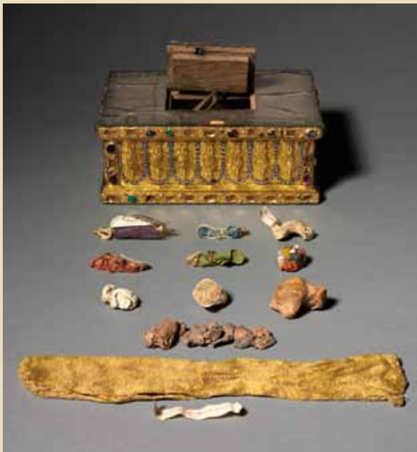
Left: Reliquary Bag from the Gertrude Altar, 13th century, silk, 14.5" x 3", Spanish (Mudejar), courtesy of the Cleveland Museum of Art, gift of the John Huntington Art and Polytechnic Trust.