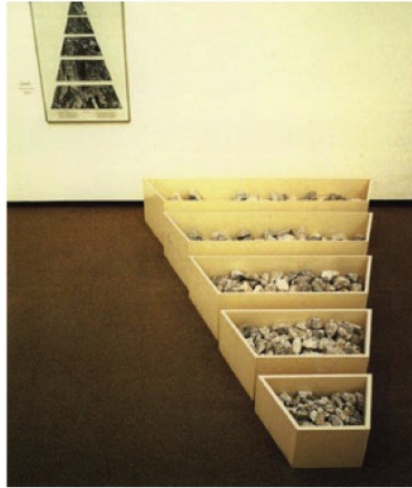
Fig. 4. Robert Smithson, A Non-Site: Franklin, New Jersey (1968), installation view. Painted wooden bins, limestone, gelatin-silver prints and typescript on paper with graphite and transfer letters mounted on mat board, 16 x 82 x 103 inches.

Noting that Michelson’s work from this period “became focused on intersections of the temporal and the spatial—and of ways of bringing previous states of a locale into the here and now,” Everett referred to Earth’s Eye , Cult of Memory , and Permanent Title as “non-sites,” cleverly evoking Smithson’s own New York City gallery installations of the late 1960s. Smithson defined his non-sites—installations of dirt and rocks brought into Manhattan from the pine barrens of New Jersey—as referents to remote places (fig. 4). He explained in an interview that “the site, in a sense, is the physical, raw reality—the earth or the ground,” whereas the non-site, in the gallery, is but an “abstraction” (Smithson 1979 [1970], 160). His purpose was to employ physical material to evoke a place, but also to affirm its absence, to attest to its existence somewhere else. The relationship of Smithson’s non-site installations to “The Monuments of Passaic” is tenuous, though his partner Nancy Holt recalled that the non-sites emerged out of a “new consciousness of the post-industrial terrain” that Smithson garnered in his walks through New Jersey’s decaying urban areas (Holt 1979, 5). By transporting materials from the ruined outliers (the site) into the urban core of New York City (the non-site), Smithson seems to have strengthened the dialectic of center and periphery, yet, as Owens has argued, the non-site is relegated to being “a vacant reflection of the site” (Owens 1979, 122). 14