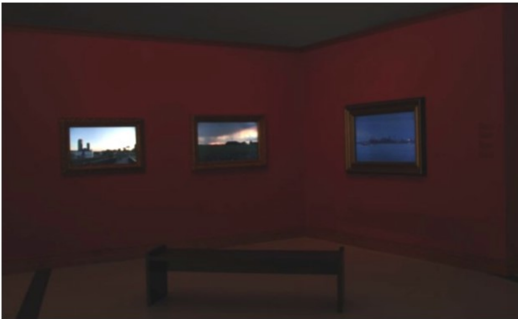
Fig. 6. Alan Michelson, Of Light After Darkness (2007), installation view. Three digital videos, gilded frames, 31 minutes.

comprised of three video “canvases,” each featuring a thirty-one minute video shot at sunset at a location integral to the history of colonialism and industrialization in Ontario (fig. 6). The first work in the series pictures Fort York, a military garrison erected at Toronto by the British in 1793 that is now a National Historic Site. The second video captures images of the Stelco Steel Mill belching smoke into the skies over Hamilton Bay, and the third is of wind turbines located at Port Burwell on Lake Erie. In framing these scenes—perhaps even these processes—in the guise of nineteenth-century landscape paintings, Michelson engages directly with the legacy of landscape representation and its complicity in colonialism.