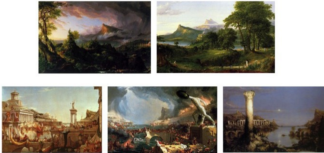
Fig. 7. Thomas Cole, The Course of Empire (1833-1836). Five panels, oil on canvas. Four panels 39.5 x 63.5 inches; center panel 51 x 76 inches.