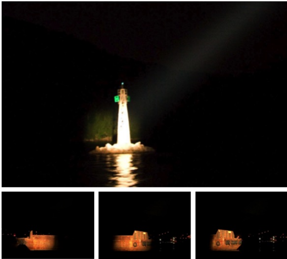
Fig. 8. Alan Michelson, Shattemuc (2009), video stills. Digital video, 31 minutes, soundtrack by Laura Ortman.

irrevocably scarred in the process. The three panels of Of Light After Darkness compress this cycle into fewer “moments” and distribute the impact of empire building over three separate landscapes, but they also process sequentially. According to Michelson’s website, “Each site represents a different environmental era—past, present, future—in the colonization and development of the area.” Like Cole, Michelson assigned each panel a different title— Gloom of Approaching Night ; Dying Day ; and Glorious Light of the Setting Sun —all aptly chosen for scenes filmed at sunset. Michelson’s titles are culled from the writings of photographer Edward S. Curtis (1868–1952), the master perpetrator of the trope of the “vanishing Indian.” 17